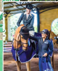
Caprino 2017 4 Year Old Young Horse Champion

West Coast EQUITEC Vets Performance Products