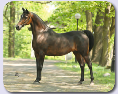
The beautiful mare Elwira

Alphalea will also be standing the chestnut stallion, Status LL, by the renowned sire Marwan Al Shaqab, so be prepared to see some stunning progeny on the ground by these two stallions next year.