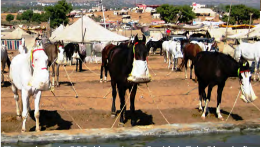
Horses from the RRI ride resting at Pushkah Fair. Below: Frazzica Productions launched a documentary on the plight of the Mawari horses at the Sundance Film Festival in August.

The breed deteriorated in the 1930s, but today it has regained some of its popularity. Frazzica Productions has made a documentary on these indigenous horses, and are promoting it world -wide to raise awareness and funds to help support the existing horses and provide education and equipment to ensure a kinder way of training. Visit: www.indiegogo.com/projects/marwari or www.marwarimovie. com to see the movie trailer.