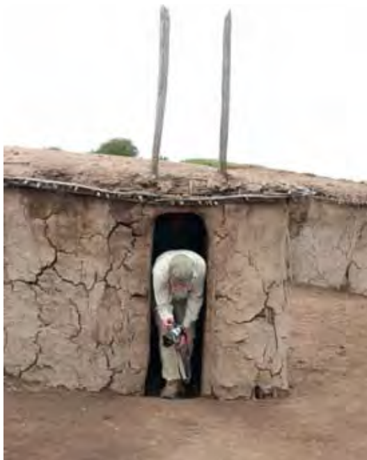
Visiting a Maasai village.

The staff greets us with warm drinks, port, wine, beer and delicious hors d'oeuvres while we dry out by the fire. After hot showers and dry clothes we head to the mess tent for a delicious gourmet dinner cooked on an open fire and in a small oven. The meals are amazing