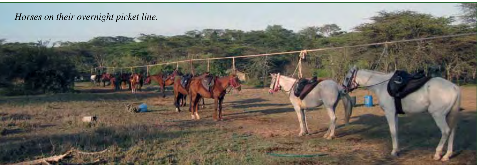
Horses on their overnight picket line.